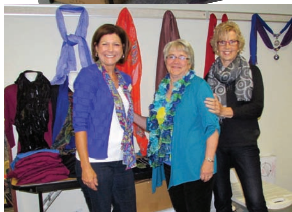
SI/Reno members sold Sorptri-Wear.