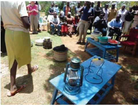
SI Denmark and SI Kenya joint solar project.