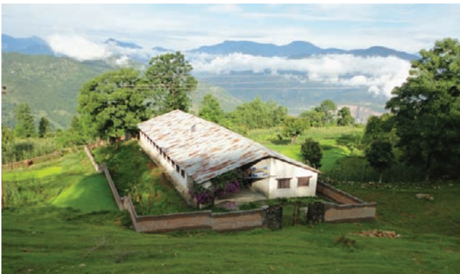
The girls' dormitory at Thulipokhari, Nepal

SITM has removed many barriers for the people of Thulipokhari, and our own lives have been enriched in the process.