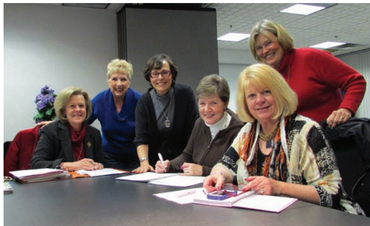
The Thanks to Youth Committee is already hard at work planning for the May 22 annual recognition of Unsung Heroes among our youth, along with the presentation of youth scholarships.