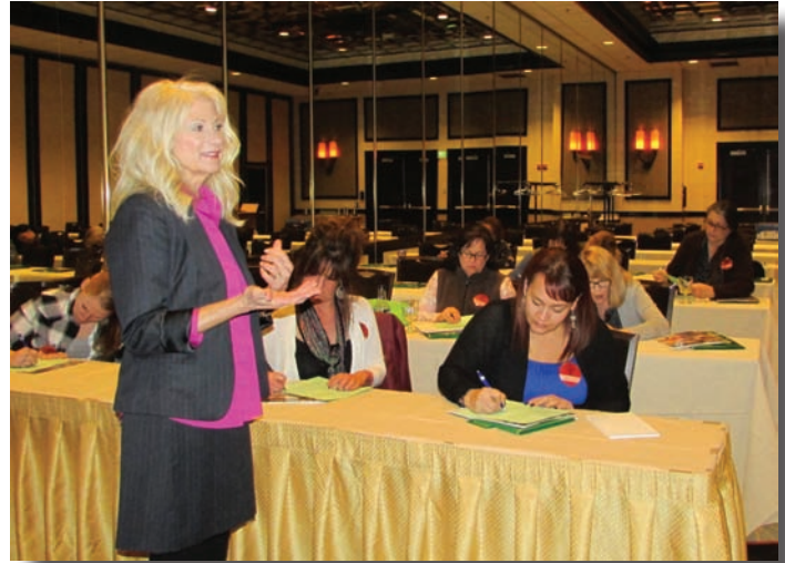
"I was blown away. It was so organized and informative."