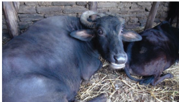
Conditions have improved. Even the water buffalo are smiling.

In 2003, SITM launched the Animal Assistance Program for the village, providing low-cost loans to villagers for the purchase of bee hives, chickens, goats and water buffalo. Repayment of loans provides for additional loans, and interest supports the