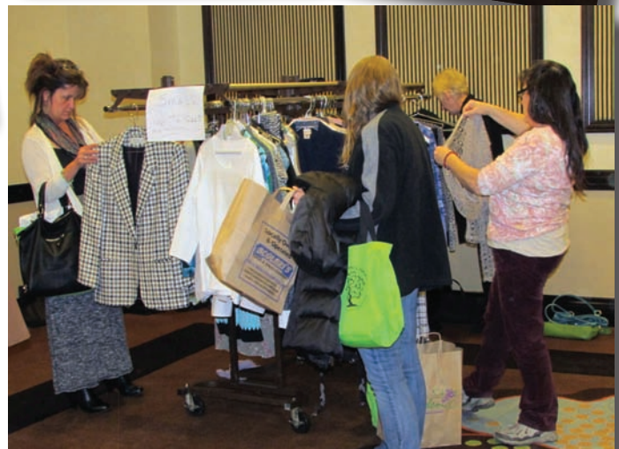
"Meeting the Soroptimist ladies was great as good role models for the community."