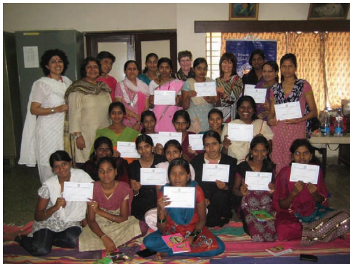
Graduates of SI/Punè Metro East’s “Girls Moving Forward” program receive certificates of completion.

management skills, teaching them about breast cancer awareness, providing pre-marital counseling, education on nutrition, yoga, and first aid. The girls are first generation learners and come from deprived backgrounds and often violent homes. The workshops help the young girls to be confident and face various challenges in life.