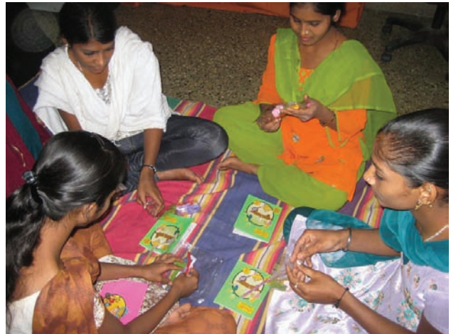
The girls work on a craft project as part of SIPME’s Girls Moving Forward project.

SIPME conducts non-formal education workshops for young girls in or around their community on home budgeting, personal hygiene and grooming, anger