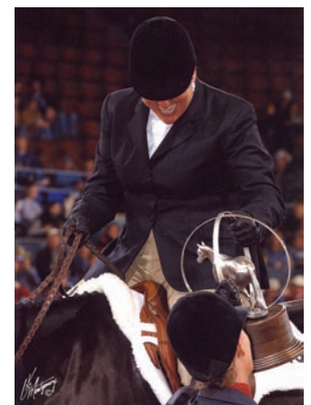
Winning the World Championships