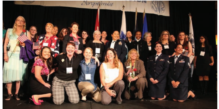
Some of the women honored Friday night.

Kight; and a presentation of the women honorees in photos with military ranks and service records.