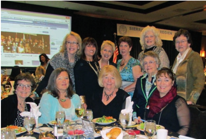
SITM members at the Saturday night banquet at conference.