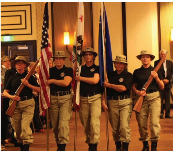
The VA Women Veteran's Color Guard