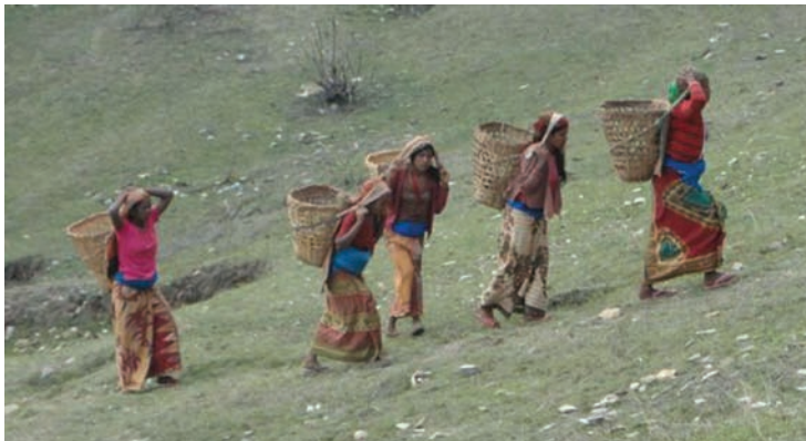
Village women load bricks into their baskets, which they will carry on their backs to the workers constructing the wall.