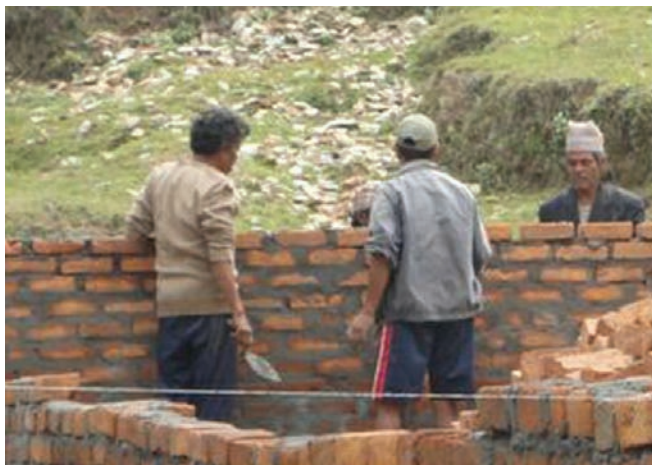
Workers put the finishing touches on the brick wall.