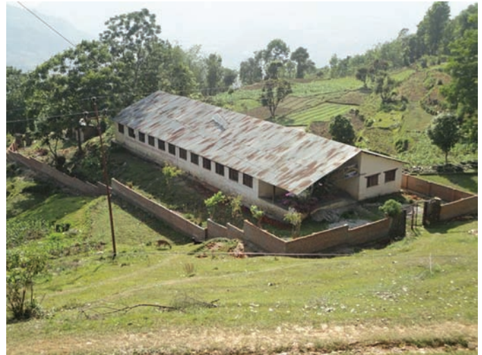
Purna Guyan (Whole Knowledge), the girls dormitory at Thulipokhari, Nepal with the new security wall complete.

The IGU Committee continues to accept pledges for the 2012-13 year or donations in any amount to support school scholarships for girls, the animal assistance program for villagers and the new women's empowerment program. Contact any member of the IGU Committee for more information.