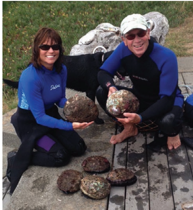
Abalone diving with Dad in August.