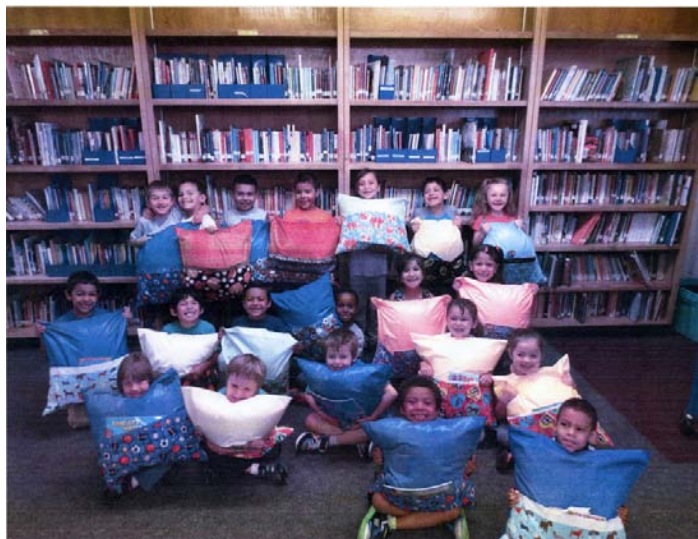
Libby Booth students with their Reading Pillows.

Libby Booth students who received handmade Reading Pillows sewn by SITM members recently wrote thank you letters to members. In return, the students sent handmade paper Christmas ornaments for each member.