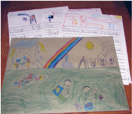
Each student wrote a thank you note and sent it to SITM members in a beautifully colored envelope.