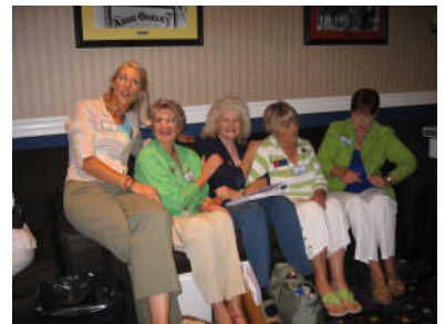
Relaxing at COTR