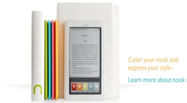
Color your nook and express your style - Learn more about nook -

I recently purchased my Nook from Barnes & Noble and really enjoy the reading experience. The screen is very easy on the eyes with no glare and font size selection to make the letters larger if needed. My nook allows me to access ebooks anytime, the ability to develop a "wish list" of titles for future reading, and the retention of all titles purchased in my endless archive. My nook can hold up to 1200 titles including books, newspapers, magazines, etc. With a great battery life my "book" is ready anytime to transport me to another place through reading an ebook. I have also noticed the electronic book versions are significantly less expensive than printed books. With the electronic book format it's not necessary to worry about storage for bulkier actual books. Think of the trees we save by using ebooks!