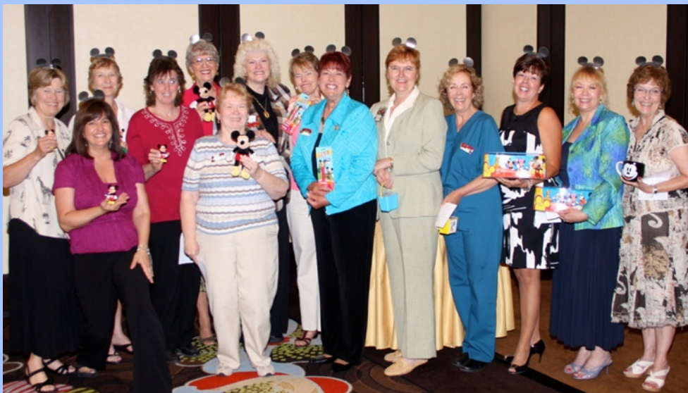
2009-10 SITM Board