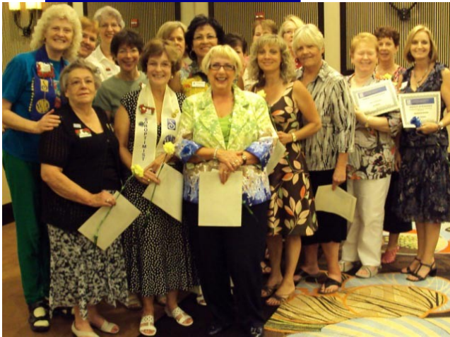
Perfect Attendance Award Winners