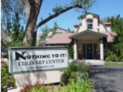
Nothing To It Culinary Center

During Hot August Nites, the Atlantis has asked us to move for the week. Since parking is nonexistent during that time, we gladly oblige.