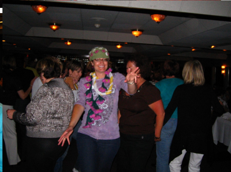
Yes, we had fun!