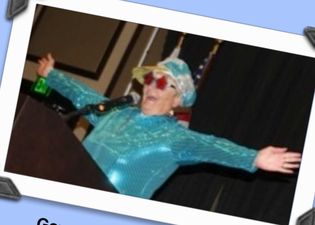
Governor Sue Camp