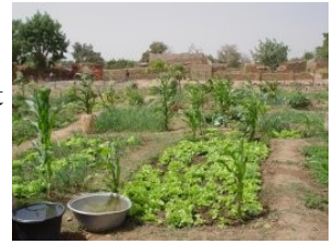
Fruit Tree Plantation in Mali, Western Africa

Information about this project and others is available online at www.soroptimistprojects.org