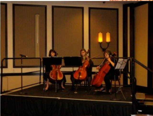
Music was provided by the Award Winning Youth Group from the Philharmonic