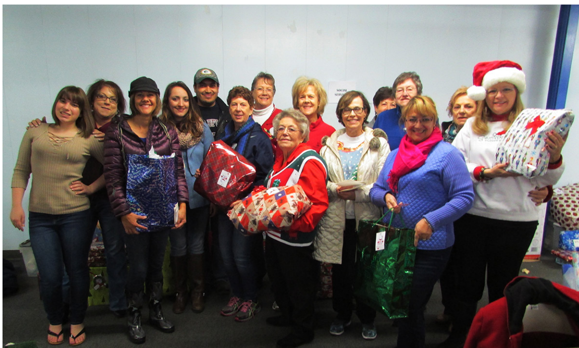
Some 21 SITM members, family and friends joined the Saturday wrapping team.