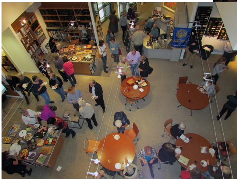
A view of the action from the second floor.