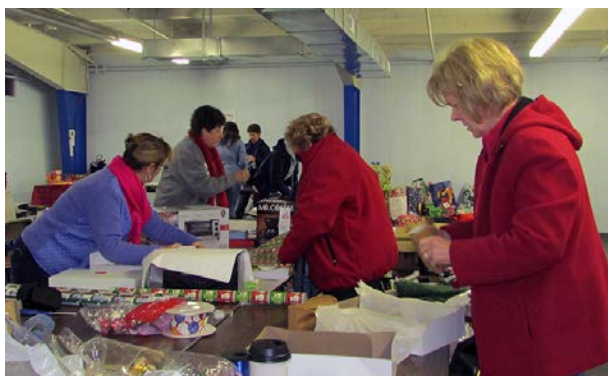
Organized chaos in progress.