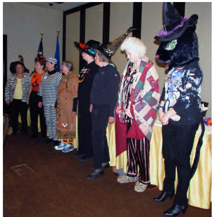
The competition for best costume or hat.