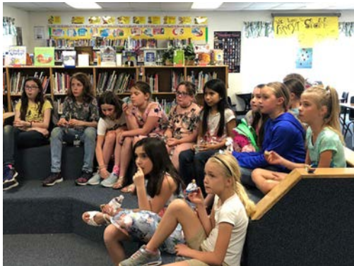
The DIBI girls at Hunter Lake Elementary School.