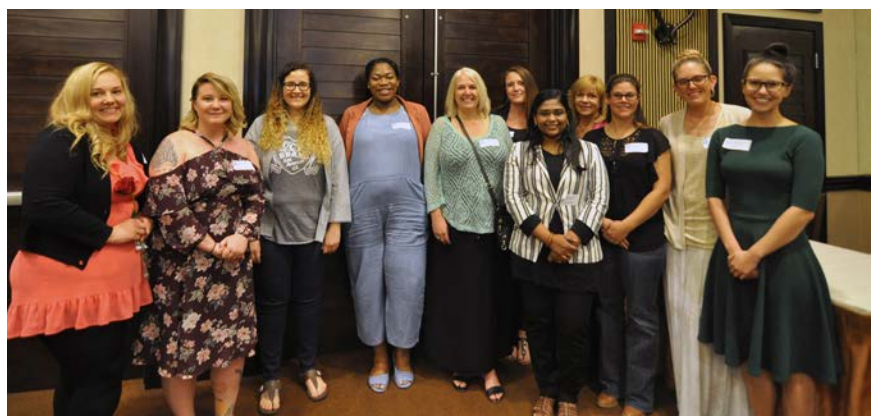
The 2018 class of SITM Women's Scholarships.