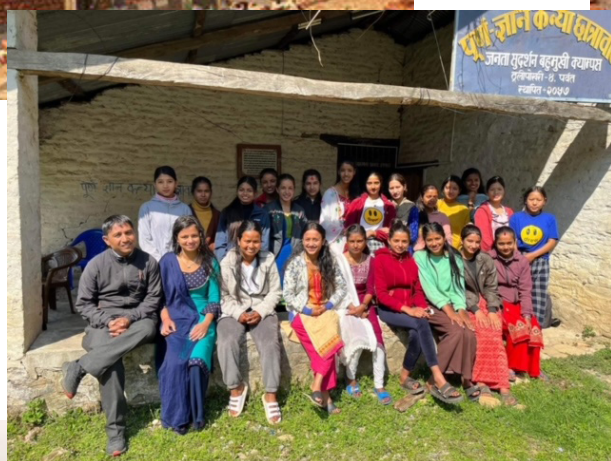
2022-2023 Scholarship recipients in front of the original dormitory