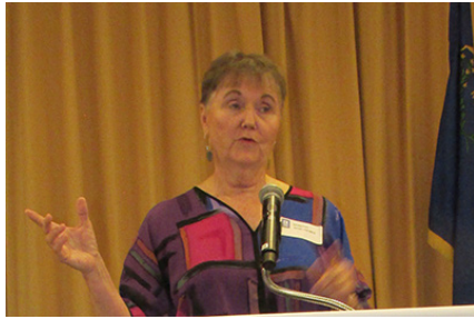
Dorothy Nash Homes