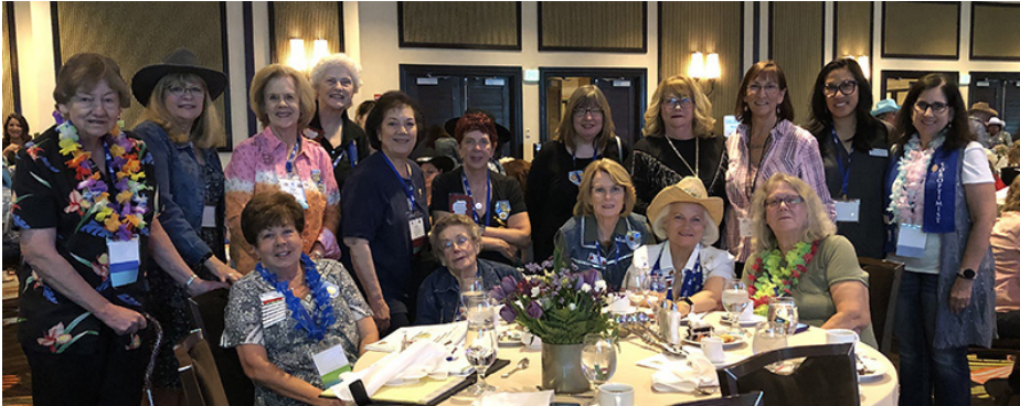
SITM members at the Friday night dinner.