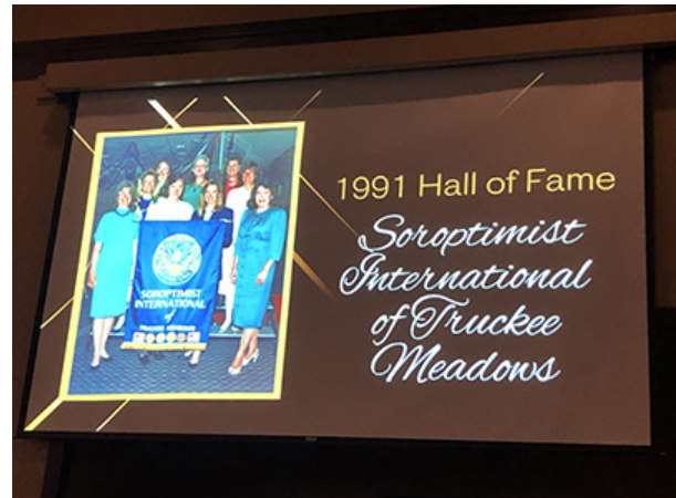
Pictured at right are SITM members who attended NWF’s 40th Anniversary. SITM was recognized as the 1991 Hall of Fame Recipient.