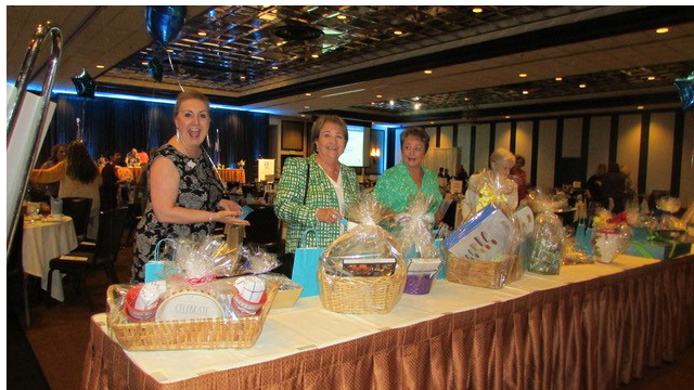
Members and guests check out the raffle prizes.