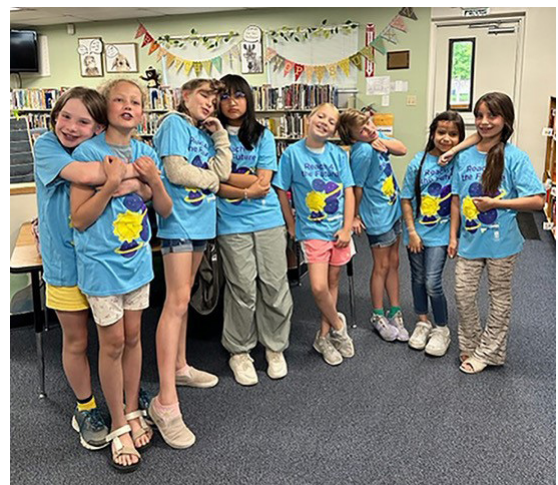
Hunter Lake girls at the "wrap party" with SITM members, and showing off the t-shirts they designed.