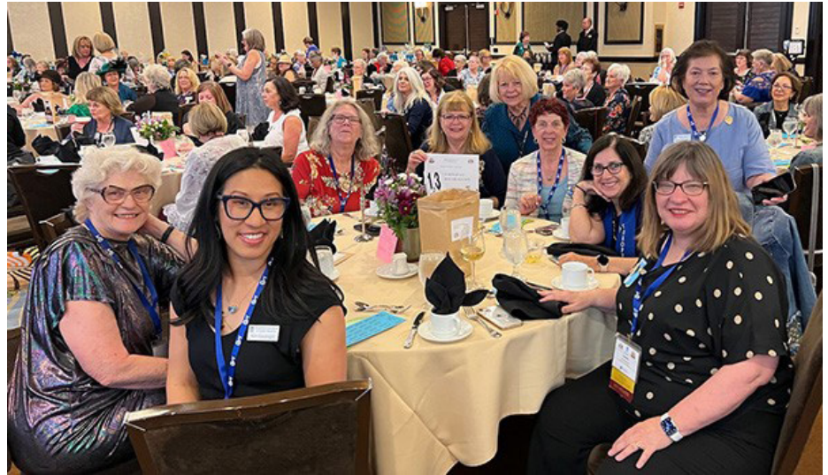
SITM members ready for lunch and business on Saturday.