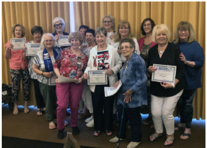
Assembled at the July 20 business meeting were members acknowledged for Perfect Attendance.

There are many ways to count Perfect Attendance. Show up every Thursday for lunch, of course. But “make-up meetings” count towards being perfect. Here’s how: Attend a monthly SITM Board meeting; attend another club’s meeting; attend a district or region meeting or SIA or SI Convention. One make-up is