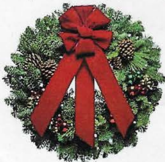
20" Jingle Bells Christmas Wreath

Thank you for supporting Soroptimist International of Truckee Meadows !