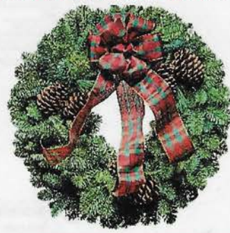
20" Highlander Christmas Wreath