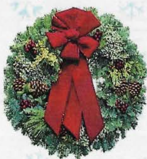
20" Alpine Christmas Wreath