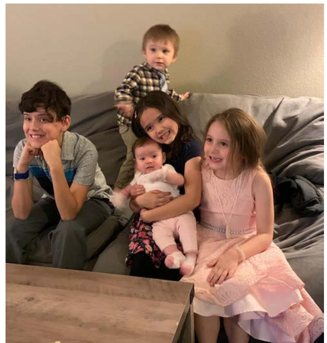
All five of Susan's grandkids in the same place.