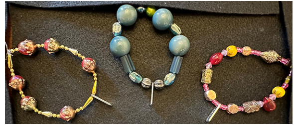
Beads of Strength made by the young women at NYEP and the notes they attached