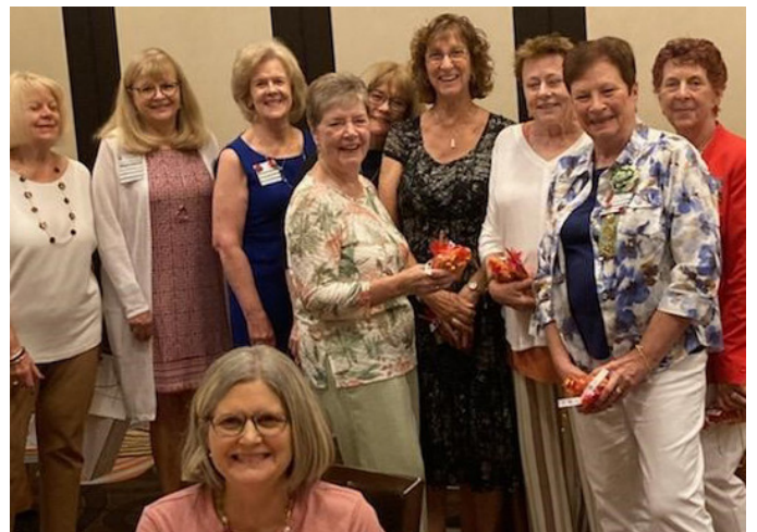
The 2024-2025 SITM Board.