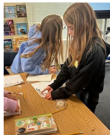
Hands-on project at right. Notice the Science Notebook nearby for detailing observations.