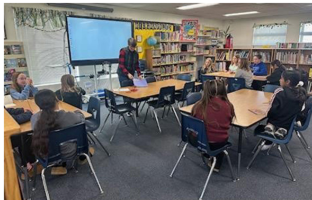
Classroom instruction above.

Some lessons in color and making a color wheel preceded the girls' favorite lesson each year – decorating cookies for the holidays. The lesson was reinforced as they were only given red, yellow and blue frosting to make their own colors for the cookies.