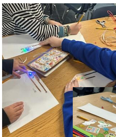
Strategically placing the copper strips,