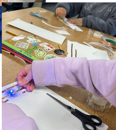
Adding the battery and LED light.